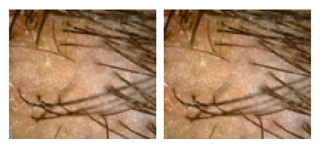
Figure 4. Photo of the hair before applying the Pyretrin-D series.