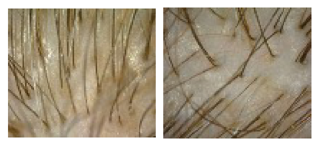
Figure 7. Photo of the hair after applying the Pyretrin-D series for 100 days.