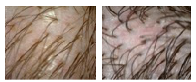
Figure 3. Photo of the hair after applying the Pyretrin-D series for 100 days.

The above patient had symptoms of peeling skin. As seborrheic dermatitis progressed, the lesions turned into irregular erythematous spots with yellow scabs. There were also diffuse inflammatory lesions covering the entire surface of the scalp. The dried layer of dead skin