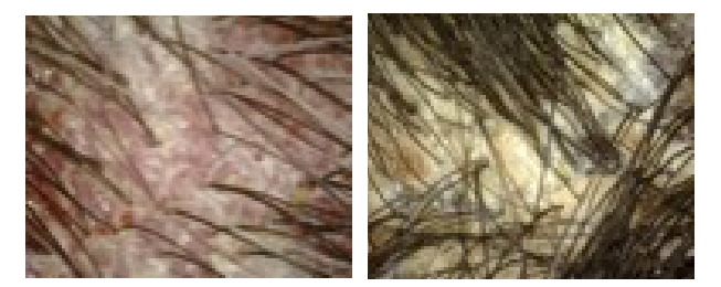
Figure 2. Photo of the hair before applying the Pyretrin-D series.