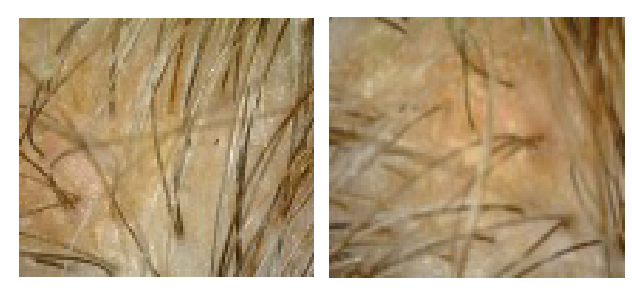
Figure 6. Photo of the hair before applying the Pyretrin-D series.