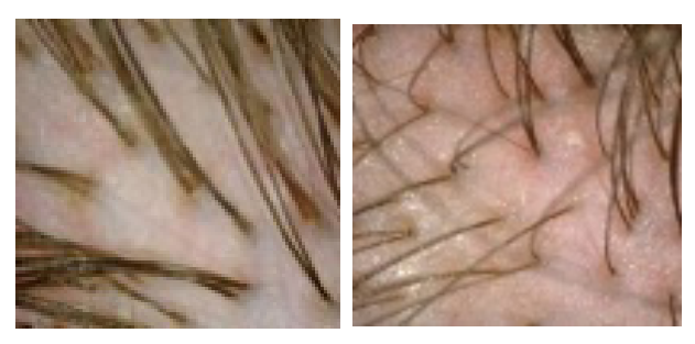
Figure 5. Photo of the hair after applying the Pyretrin-D series for 100 days.

In another patient, similar results can be observed confirming the effectiveness of the applied series. Problems related to the hairy scalp have been eliminated. The layer of dead skin and sebum that formed the crust has been removed. The patient stopped complaining of excessive itching. Further application of the tested series will contribute to both maintaining and improving the obtained results.