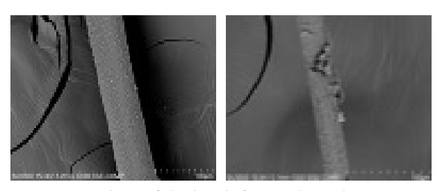
Figure 9. (A) Photo of the hair before applying the Pyretrin-D series (100 microns \times 500, 15 kV). (B) Photo after applying the series for 100 days (100 microns \times 350, 15 kV).