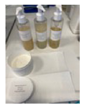
Figure 1. Pyretrin-D trichology series.

The preparation of cosmetics is presented below (Table 1-4). The series consists of four products. Figure 1 shows ready-made formulations.