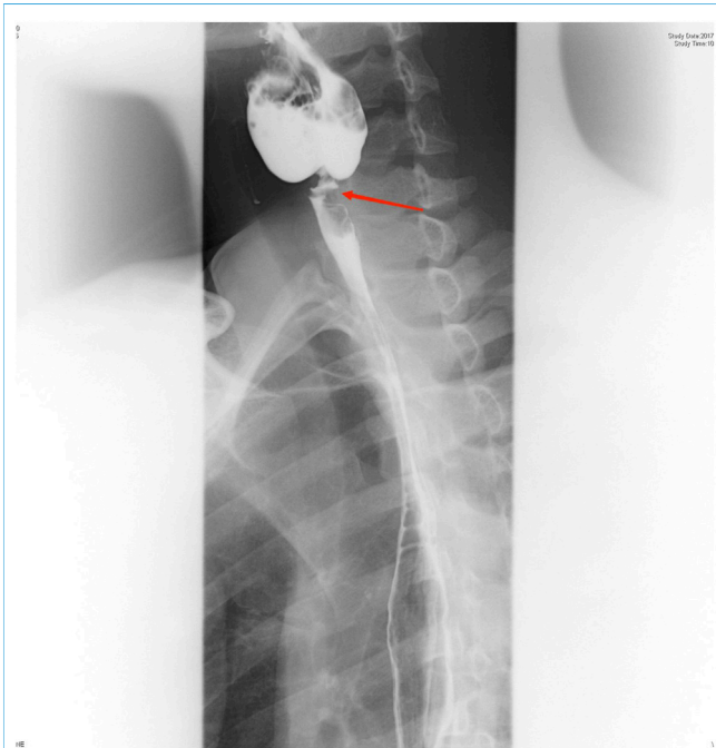
FIGURE 2 | Esophagus barium swallow test: the proximal part of the esophagus appeared severely narrowed at the level of the C6 vertebral body, and the esophageal lumen proximal to the stenosis was significantly dilated.