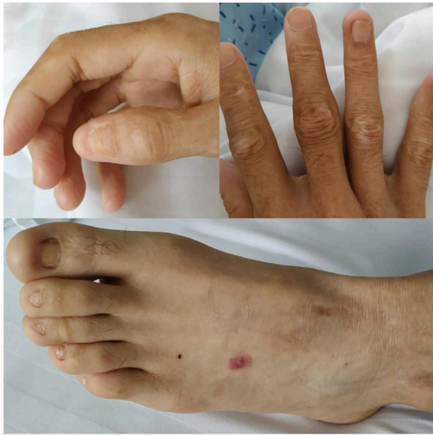
FIGURE 1 | Clinical manifestations of the patient's hands, feet, nails and skin: incomplete and deformed nails, skin scar.