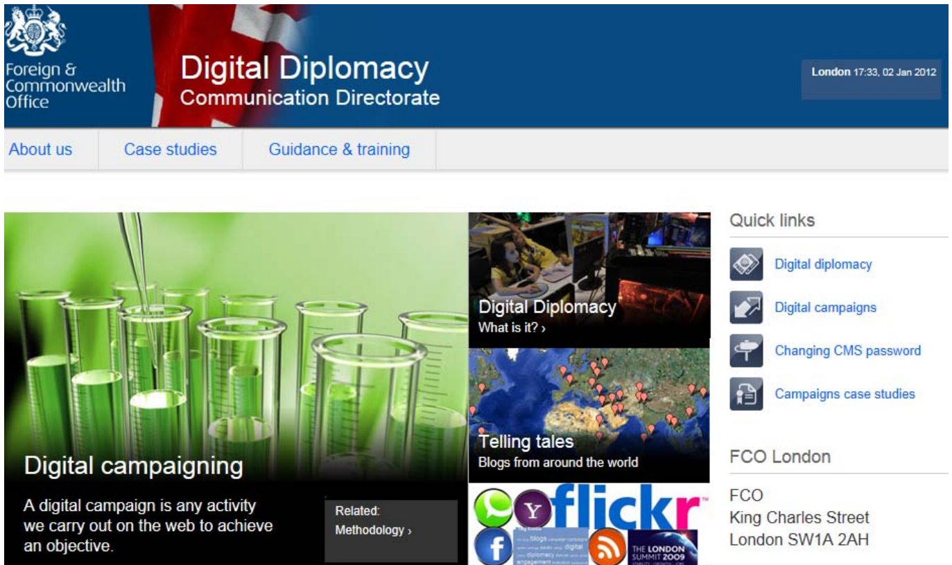
PICTURE 5. DIGITAL DIPLOMACY WEBSITE

(AVAILABLE AT http://digitaldiplomacy.fco.gov.uk/en/ )