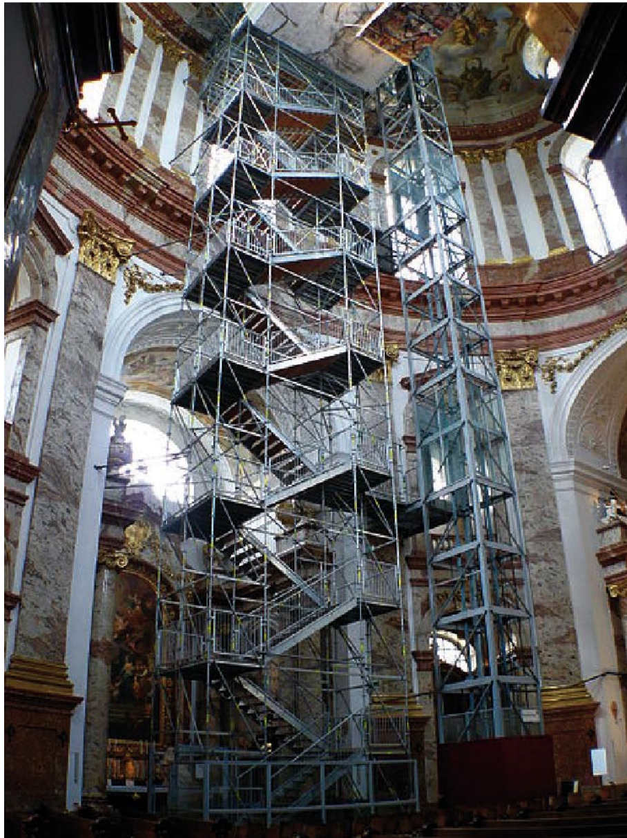
PHOTO 2. PASSIVE-INTERACTIVE PARTICIPATION : KARLSKIRCHE IN VIENNA, AUSTRIA, 1716-1737 (INTERNAL TEMPORARY LIFT AND VISITORS' PLATFORM).

Source: http://www.peri.com/en/projects/projects/building-refurbishment-project/karlskirche_church_vienna.cfm