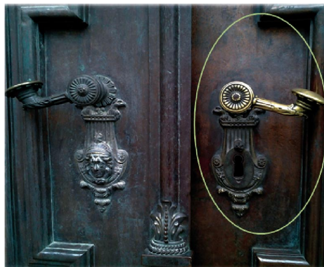
PHOTO 1. INVOLUNTARY PARTICIPATION “BY USE”: MAIN ENTRANCE OF THE GYÖR BASILICA, HUNGARY, 1000-1009 (DETAIL)

finance the conservation work. Here we have a situation in which the public is involved in a passive-interactive way in participatory conservation.