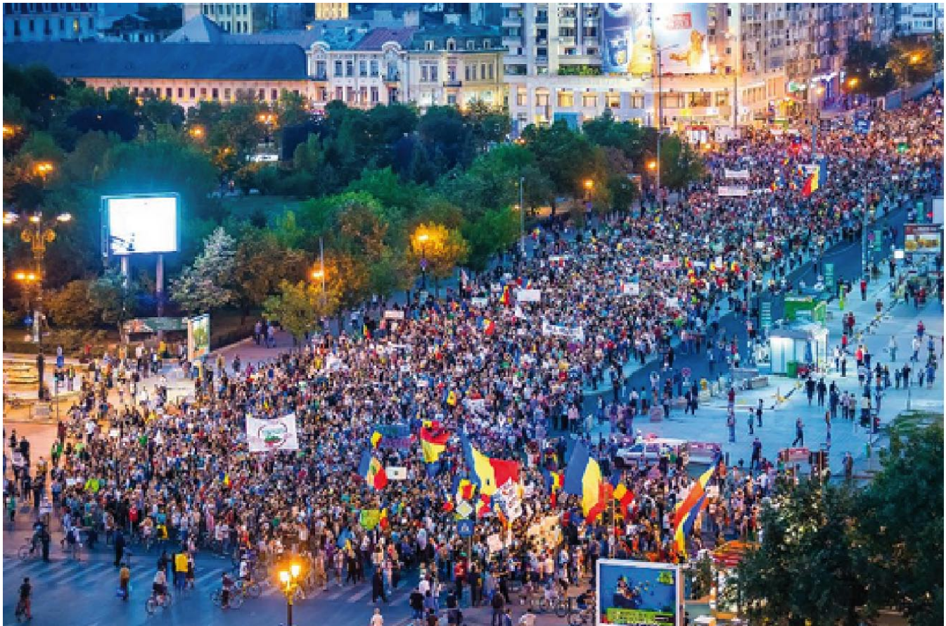
PHOTO 3. VOLUNTEER/SPONTANEOUS PARTICIPATION – PUBLIC MOBILISATION IN THE CASE OF ROSIA MONTANA, ROMANIA