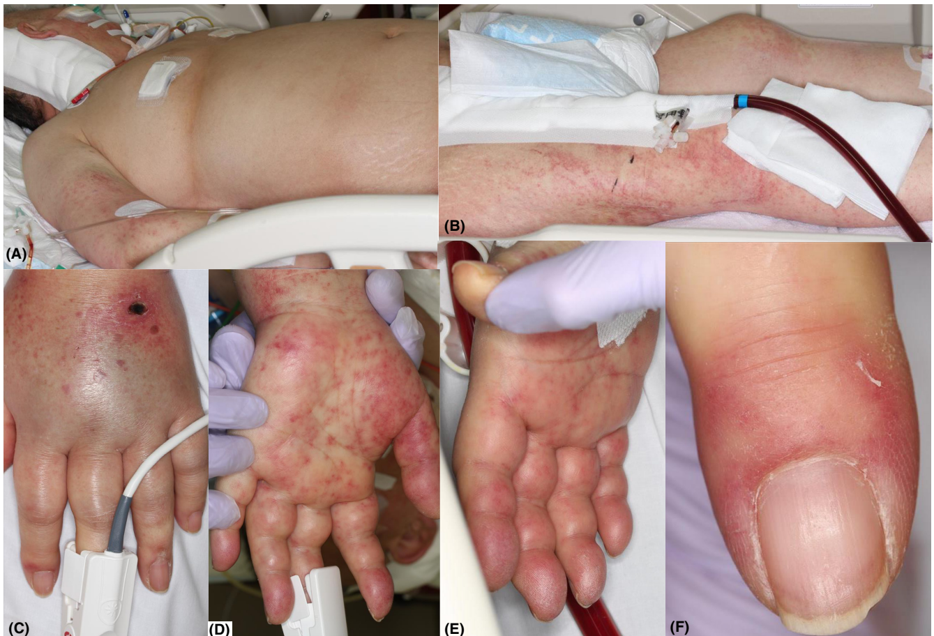
FIGURE 1 On illness day 27, erythema and maculopapular exanthema appeared on the trunk (A), legs (B), and hands (C). A hemorrhagic rash on the hands (D) and pernio-like lesions were seen on her fingers (E, F) and toes.

worsening shortness of breath (saturation percentage of oxygen in the artery blood 74%). The chest radiograph detected her bilateral interstitial pneumonia, and the treatment of artificial respiration started. Favipiravir, dexamethasone, remdesivir, and empiric antibiotic therapy were administered because of a positive blood culture ( Corynebacterium striatum , Klebsiella species). She was given lactulose, subcutaneous low molecular heparin, and continuous intravenous heparin infusion for prevent COVID-19-related thrombosis. On