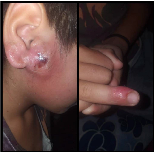
FIGURE 2 Deep cutaneous ulcers (left picture) and paronychia (right picture) in a 3-year-old boy with neutropenia.

infection because of mutations in STAT3 , DOCK8 , ZNF341 , PGM3 , IL6ST , IL6R , and CARD11 . 17