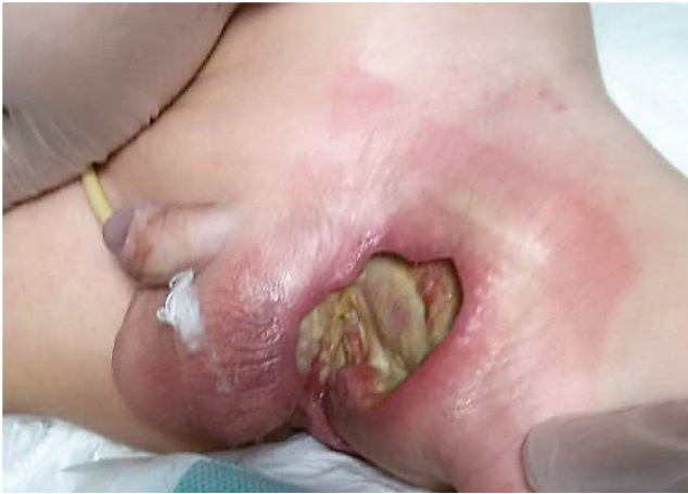
FIGURE 1 Recurrent genital abscess in a 3-year-old boy with chronic granulomatous disease (CGD).