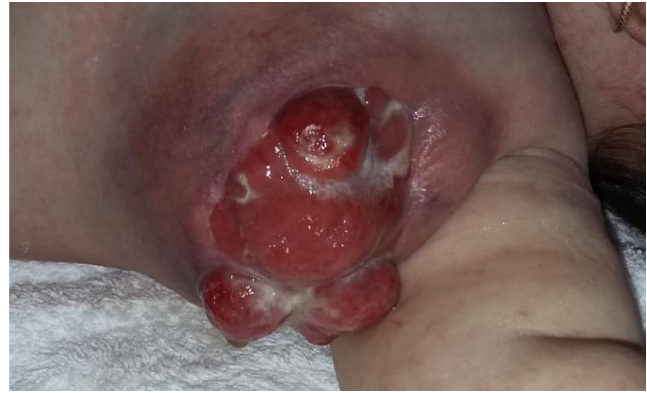
FIGURE 7 Disseminated BCG disease in an infant with severe combined immunodeficiency.

In summary, by recent advances in immunogenetic modalities, such as targeted gene panels, whole exome, or genome analysis, our understanding of IELs is rapidly growing. Future studies can provide valuable insights into the degree to which skin manifestations in IEL patients can be a warning sign and help an early diagnosis and a more favorable outcome and better quality of life.