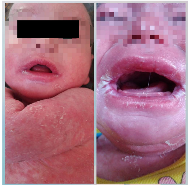
FIGURE 3 Generalized exfoliative dermatitis in a 5-month-old boy with Omenn syndrome.

However, most skin manifestations are not pathognomonic for a specific immunodeficiency and can be detected even in immunocompetent population. Hence the regular follow-up, and close monitor for other non-dermatological manifestations such as failure to thrive, chronic diarrhea, and demographic data such as consanguinity or family history suggestive of immunodeficiency, may be helpful to define the nature of the disease.