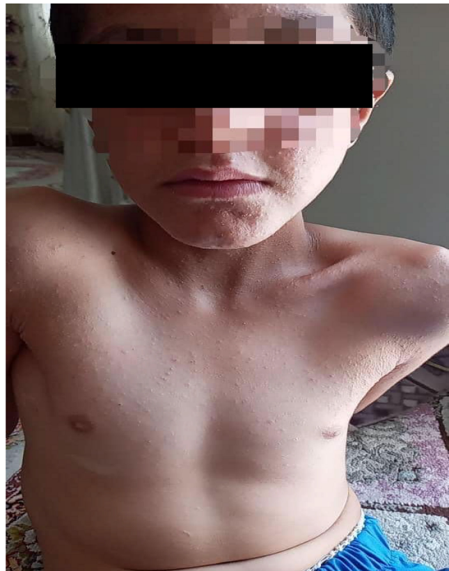
FIGURE 4 Eczematous rash in a 7-year-old boy with Hyper-IgE Syndrome.

Nevertheless, recurrent difficult-to-treat cutaneous infections (e.g., bacterial, viral, candidiasis), severe atypical eczematous dermatitis, granuloma, pigment alteration, disseminated warts, and blisters resistant to conventional treatment.