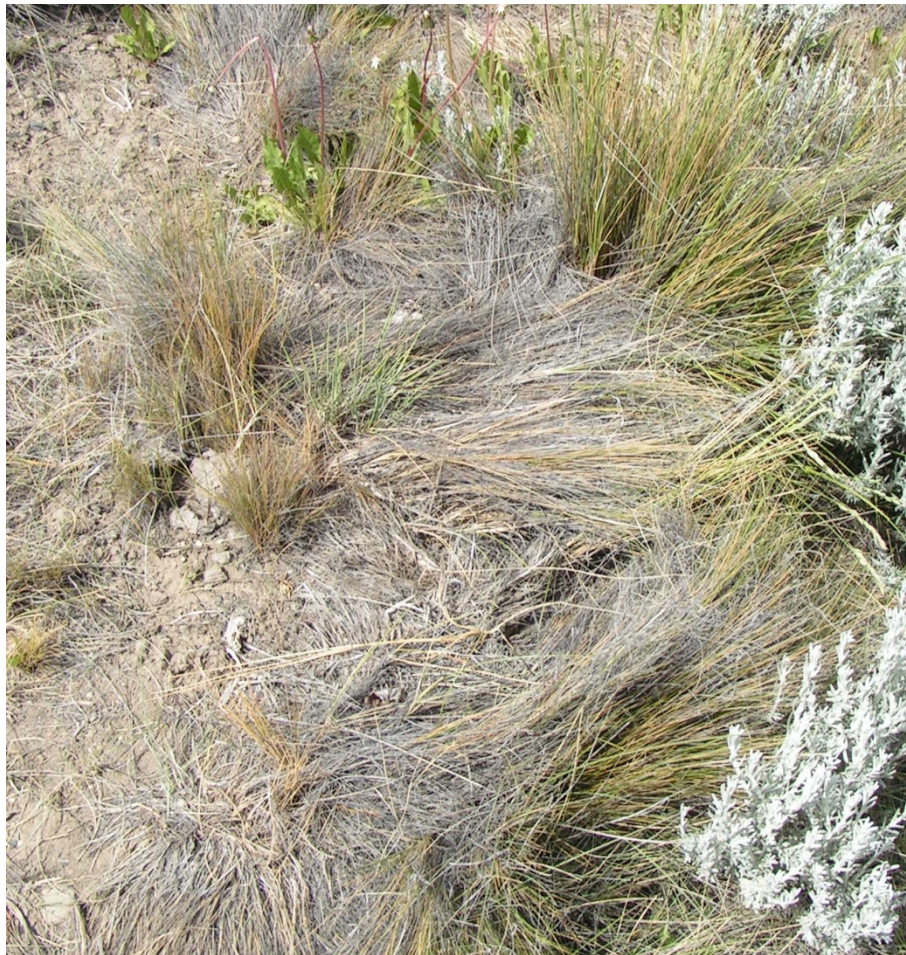
Figure 2 An example of excessive litter accumulation degrading through oxidative rather than biological means.

enters a feedback cycle of slow but progressive degradation (Savory 1999). Today, numerous studies support these observations and demonstrate that (1) partial and total rest have remarkably similar affects on arid and semiarid grassland environments (Gomez-Ibanez 1975; Cummins 2009; Weber et al. 2009a; Weber et al. 2009b; Weber and Gokhale 2011) and (2) few tangible differences can be identified among the common rotational grazing schemes in practice today (Jahnke 1982; Sandford 1983; Behnke 1999; Quirk 2002; Coughenour 2008; Homewood 2008; Briske et al. 2008).