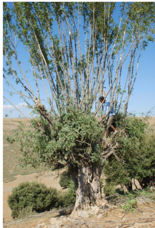
Figure 2 Pollarding ash trees to provide (a) forage, directly browsed by small stock on the rangelands, and (b) to form directly on the living tree poles and beams for future exploitation for houses' roof construction