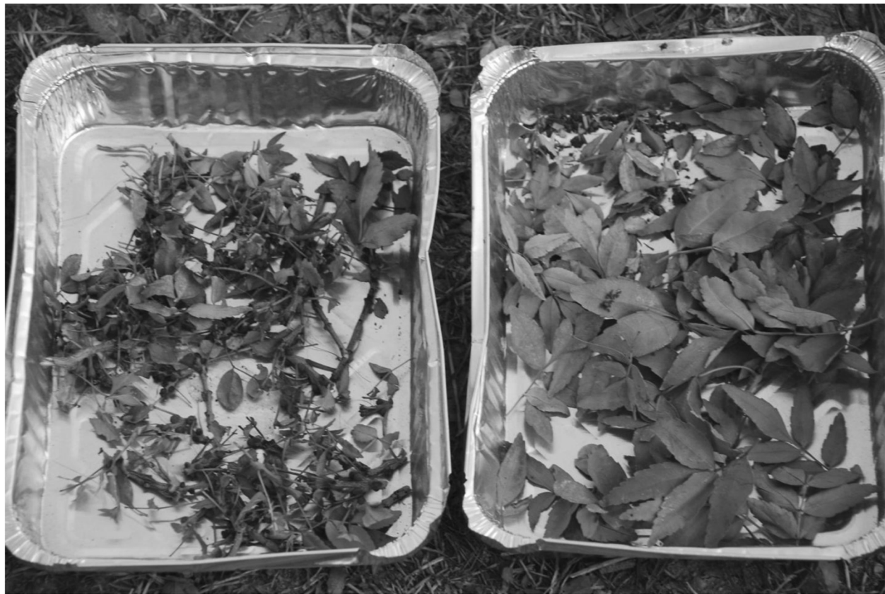
Figure 4 Differences in physical structure of ash tree refusals in sheep (left) and goats (right)