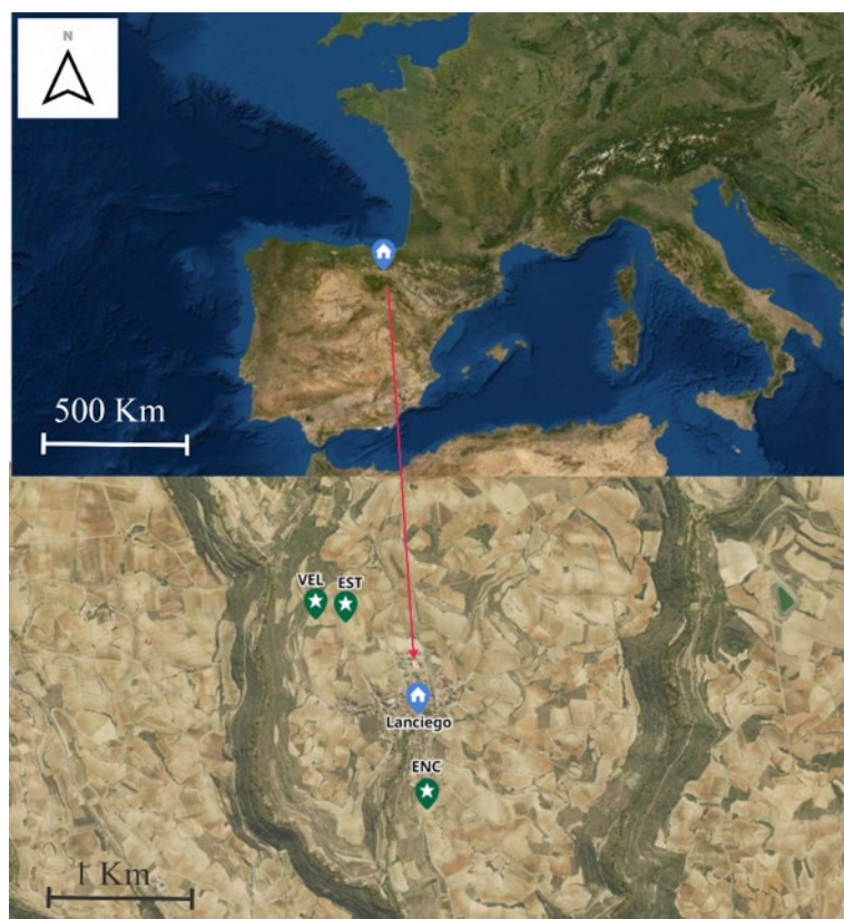
Figure 1. Location of study area and plots.